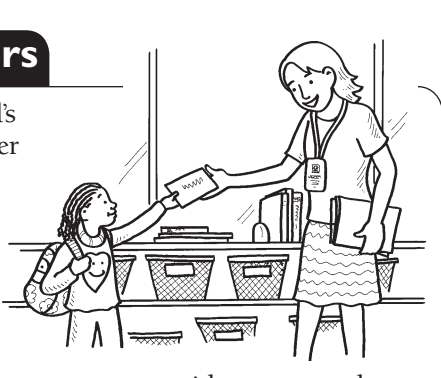
© 2018 Resources for Educators, a division of CCH Incorporated